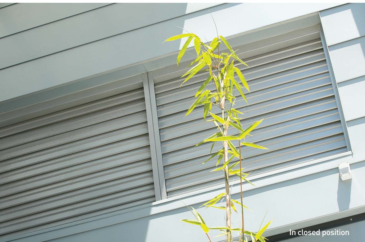
In closed position