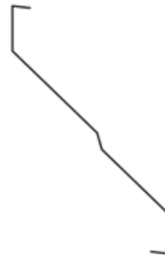
Figure 2: A Series louvre blade